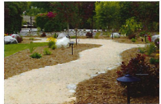
Generous areas of open space will be integrated throughout the new community, enhancing the natural setting.

Almost four miles of trails will be created throughout the former fairways to link the new neighborhoods. Natural permeable surface material and low glare lighting will create safe