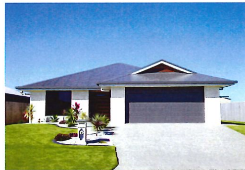
Residents of 55+ Active Adult communities prefer single story homes.

In response to resident input on traffic, schools and existing views, more than 70% of the new neighborhood will be designated for 55+ Active Adult community.