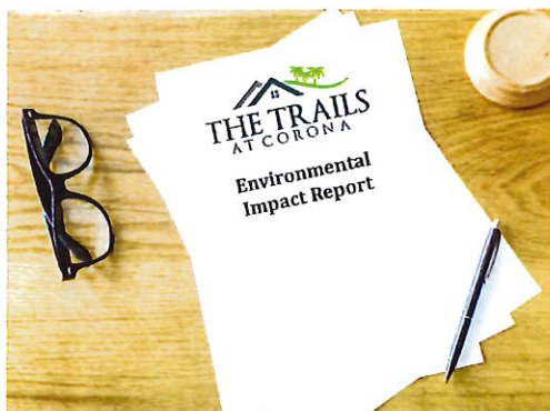
The EIR is expected to be released in Spring of 2019 and will be a public document.

The new plans are currently being reviewed through Riverside County's Planning Department. As part of the process, an Environmental Impact Report (EIR) is underway at the County of Riverside. Studies are being conducted to review the impact on everything from air quality, traffic, noise, and water quality to biological and cultural resources.